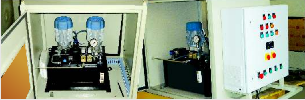
Dual Motor Hydraulic Power Pack With PLC Based Electrical Control Panel