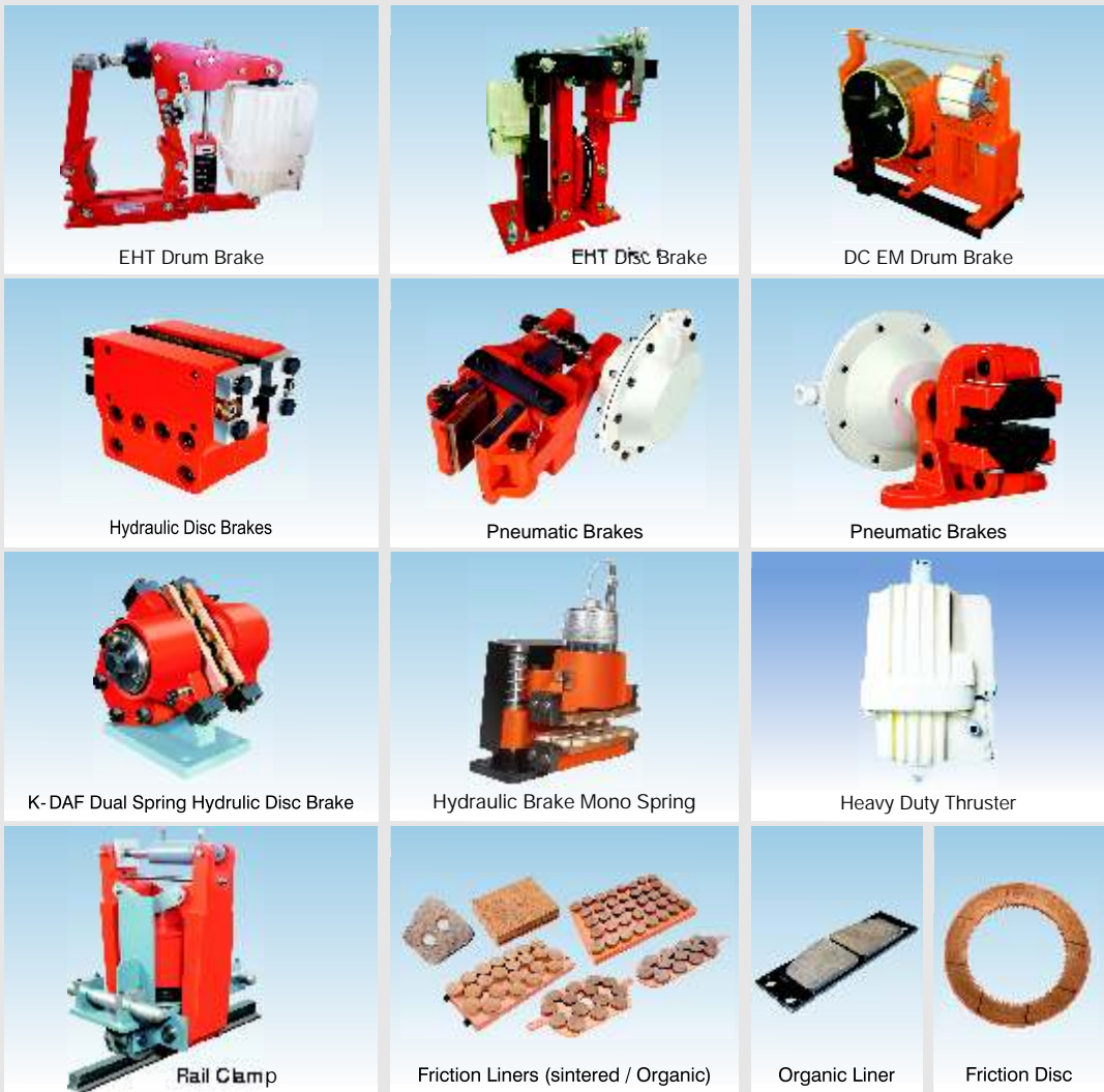
EHT Drum Brake